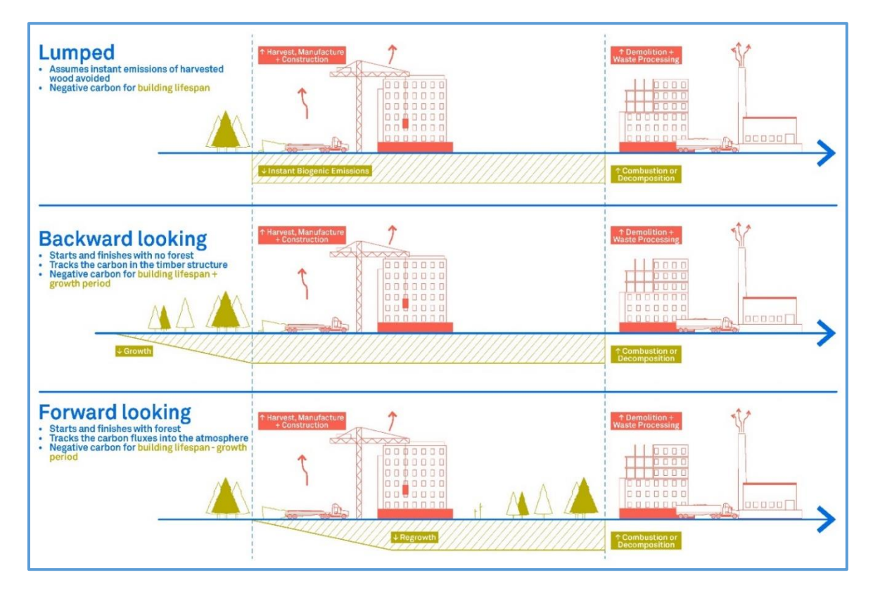
Figure 1. Approaches for calculating the sequestered carbon in timber (adapted from Hawkins, 2021)

potential of timber production. With continuing uptake of timber for UK construction, this brief review highlights the performance gaps that exist in measuring whole-life carbon performance of timber. The review focuses particularly on the gap between the carbon and greenhouse gas balance of forests and those calculated through standardised Intergovernmental Panel on Climate Change IPCC guidelines (IPCC, 2006) which could result in an overstatement of performance.